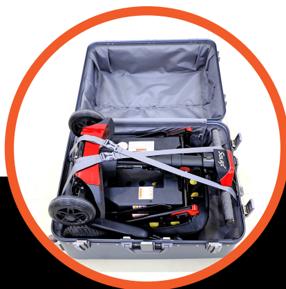
LOCKABLE HARD CASE