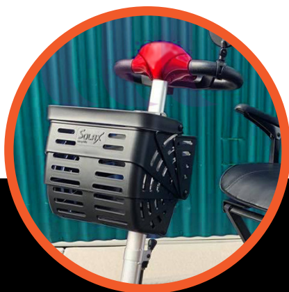
COLLAPSIBLE FRONT BASKET