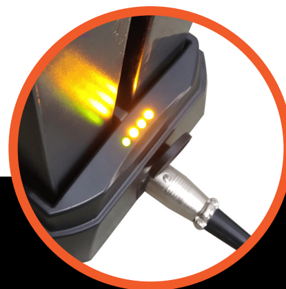
BATTERY DOCKING STATION