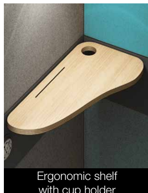
Ergonomic shelf with cup holder