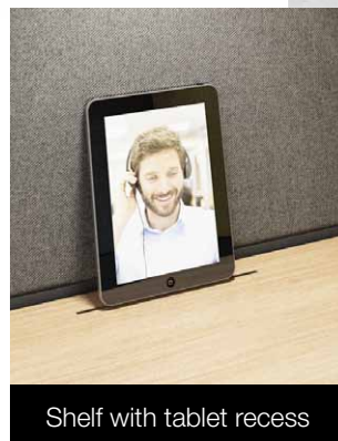
Shelf with tablet recess