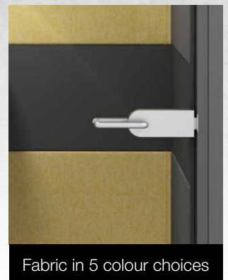
Fabric in 5 colour choices