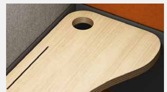
Natural oak MDN