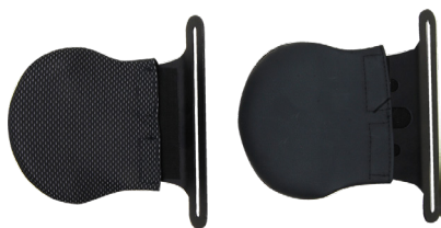
▲ E2 Deep Back E2 Deep - 6" Contour